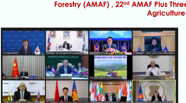
SPS Baey (third row from the top, second from left) participating in the 22 nd AMAF Plus Three.

On 26 October 2022, Senior Parliamentary Secretary Baey Yam Keng attended the 44 th Meeting of the Association of Southeast Nations (ASEAN) Ministers on Agriculture and Forestry (AMAF), 22 nd AMAF Plus Three, and 7 th ASEAN - India Ministerial Meeting on Agriculture and Forestry (AIMMAF).