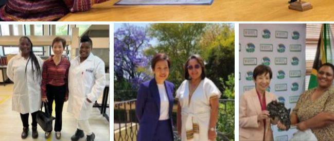
Top: Minister Fu having a discussion with South Africa's Minister of Water and Sanitation Senzo Mchunu.