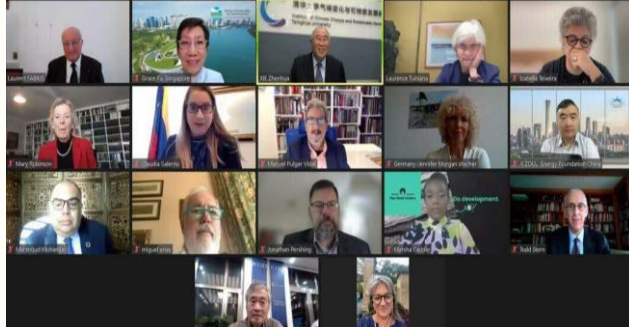
Minister Fu (top row, second from left), China's Special Envoy on Climate Change Xie Zhenhua (top row, centre) and CEO of European Climate Foundation Laurence Tubiana (top row, second from right) participating in the 4 th edition of the 'Friends of the Paris Agreement' High-Level Dialogue.

On 26 and 27 September 2022, Minister Fu was invited by China's Special Envoy on Climate Change Xie Zhenhua, and CEO of European Climate Foundation Laurence Tubiana to participate in the 4 th edition of the 'Friends of the Paris Agreement' High-Level Dialogue. They discussed ways to advance the implementation of the Paris Agreement, enhance multilateralism and cooperation to achieve our collective goals, and support a successful outcome at the upcoming 2022 UN Climate Change Conference (COP27) in Sharm el-Sheikh, Egypt. Minister Fu also shared that Parties must enhance international cooperation on clean energy solutions to provide viable pathways for the net zero transition.