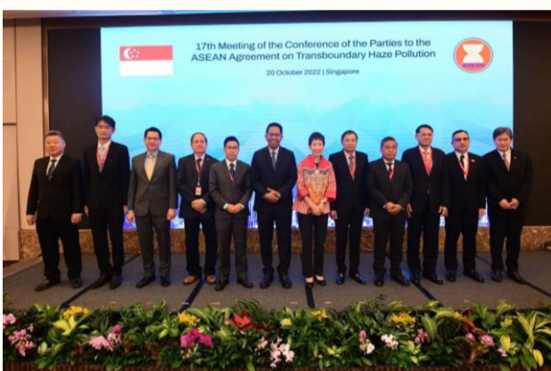
Minister Fu with ministers, officials and representatives for the environment, land, forest fires and haze from ASEAN Member States.

Minister Fu hosted the 17 th Meeting of the Conference of the Parties (COP-17) to the ASEAN Agreement on Transboundary Haze Pollution (AATHP) on 20 October 2022. It was ASEAN's first in-person meeting on transboundary haze pollution since the COVID-19 pandemic, which also coincided with the 20 th anniversary of the signing of the AATHP.