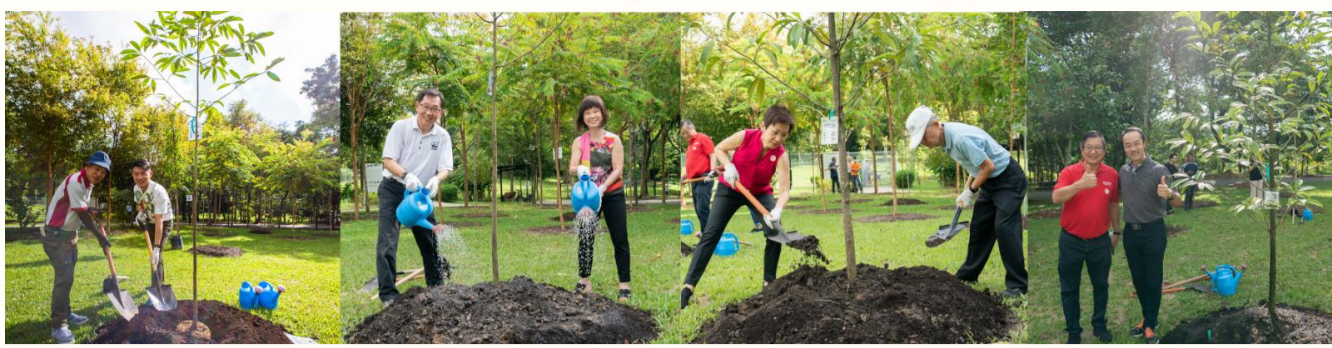
Around 100 participants, including Minister for Sustainability and the Environment Ms Grace Fu, Senior Ministers of State Dr Amy Khor and Dr Koh Poh Koon and Senior Parliamentary Secretary Mr Baey Yam Keng attended the tree-planting ceremony at Punggol Waterway Park on 15 September 2022

The Ministry of Sustainability and the Environment (MSE) commemorates its 50 th anniversary this year with a series of meaningful activities to celebrate Singapore's sustainability and environmental journey. To mark this special occasion, 50 trees were planted as part of our OneMillionTrees movement to transform Singapore into a City in Nature, a key pillar under our Singapore Green Plan 2030. On this anniversary, MSE renews our commitment to make Singapore a green and climate-resilient nation.