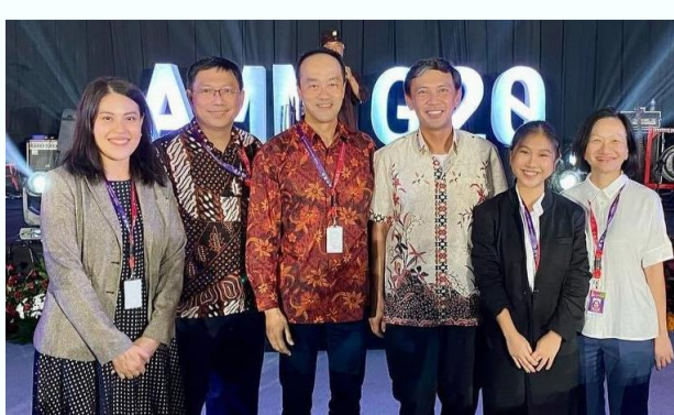
SMS Koh with the team from the Singapore Food Agency (SFA) and MSE in Bali.