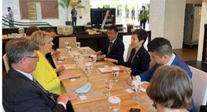
Minister Fu with Indonesia's Minister of Environment and Forestry Dr Siti Nurbaya (top), Australia's Minister for Climate Change and Energy Mr Christopher Bowen (middle), and Australia's Minister for the Environment and Water Ms Tanya Plibersek (bottom).

Minister Fu represented Singapore at the G20 Joint Environment and Climate Ministers' Meeting (JECMM) in Bali, Indonesia from 30 August to 2 September 2022. This was the first time the G20 convened a ministerial-level meeting to discuss both the environment and climate sectors, and their interlinkages.