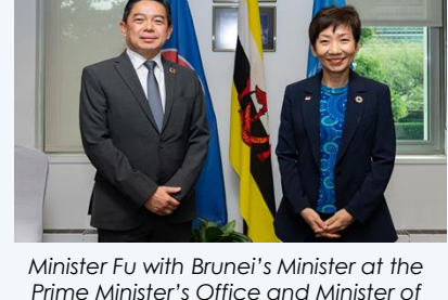
Minister Fu with Brunei's Minister at the Prime Minister's Office and Minister of Finance and Economy II Dato Amin Liew at Brunei's Mission in New York.