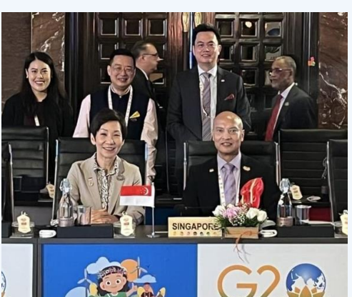
Minister Fu and officers from Singapore's Ministry of Sustainability and the Environment at the G20 Environment and Climate Sustainability Ministers' Meeting in Chennai, India.