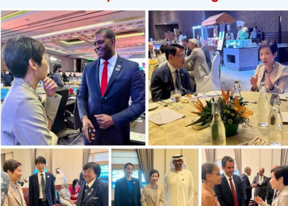
Minister Fu at the G20 Environment and Climate Sustainability Ministers' Meeting in Chennai, India.

From 27 to 30 July 2023, Minister Fu attended the G20 Environment and Climate Sustainability Ministers' Meeting in Chennai, India. Minister Fu represented Singapore, which was invited as a guest country to contribute to G20 discussions on environment and climate change.