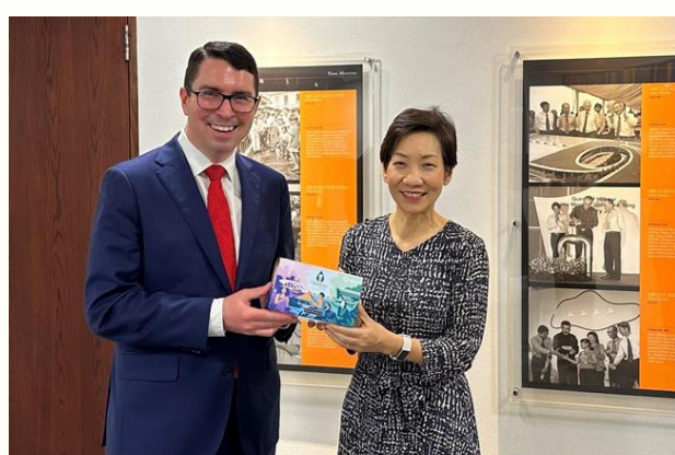
Minister Fu presenting Singapore's NEWBrew, a local craft beer made using NEWater, to Australia's Assistant Minister to the Prime Minister Patrick Gorman.

On 3 July 2023, Minister Fu met with Australia's Assistant Minister to the Prime Minister Patrick Gorman at Singapore's Ministry of Sustainability and the Environment office. They discussed potential areas for Singapore and Australia to cooperate on including food supply chains, food safety, and agri-tech R&D.