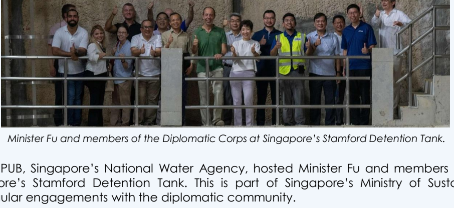
Minister Fu and members of the Diplomatic Corps at Singapore's Stamford Detention Tank.

On 11 July 2023, PUB, Singapore's National Water Agency, hosted Minister Fu and members of the Diplomatic Corps at Singapore's Stamford Detention Tank. This is part of Singapore's Ministry of Sustainability and the Environment's regular engagements with the diplomatic community.