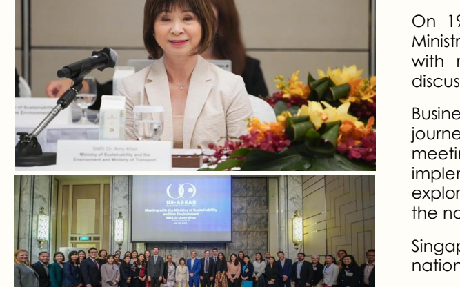
SMS Khor meeting with representatives of the US-ASEAN Business Council.