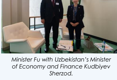
Minister Fu with Uzbekistan's Minister of Economy and Finance Kudbiyev Sherzod.