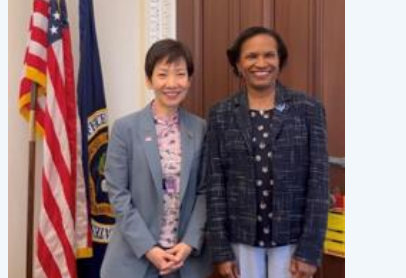
Minister Fu with Chair of the Council on Environmental Quality (CEQ), a division of the Executive Office of the US President, Brenda Mallory.