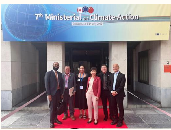
Minister Fu (centre) and officials from Singapore's Ministry of Sustainability and the Environment (right) at the 7th Ministerial on Climate Action.