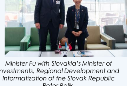
Minister Fu with Slovakia's Minister of Investments, Regional Development and Informatization of the Slovak Republic Peter Balk.