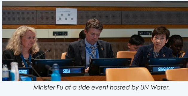
Minister Fu at a side event hosted by UN-Water.