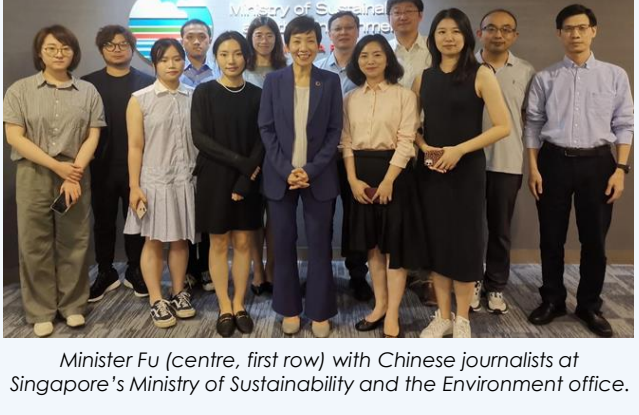
Minister Fu (centre, first row) with Chinese journalists at Singapore's Ministry of Sustainability and the Environment office.