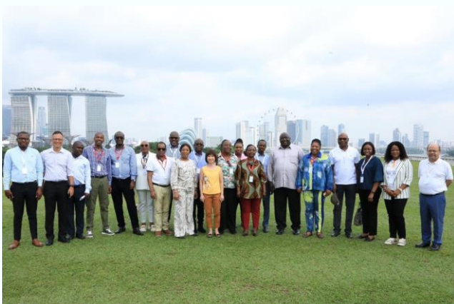
SMS Khor with the visiting Ministers and Deputy Ministers at Marina Barrage