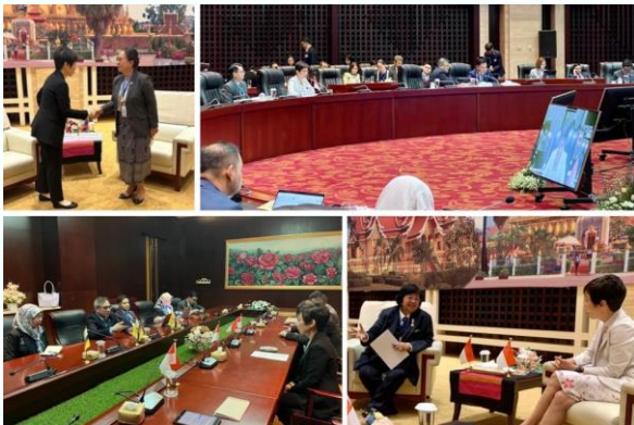
Minister Fu with Lao PDR's Minister of Natural Resources and Environment Bounkham Vorachit (top left), Minister Fu delivering an address (top right), Minister Fu meeting Brunei's Minister of Development Dato Mohd Juanda (bottom left), Minister Fu speaking with Indonesia's Minister of Environment and Forestry Siti Nurbaya